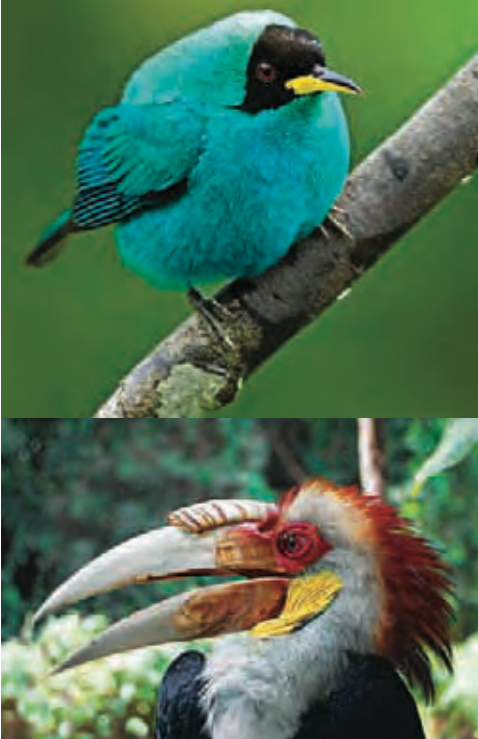
Opposite, rainbows of macaws collect minerals from a cliff at Peru's Tambopata National Reserve. Above, African penguins waddle onto South Africa's shores; a green honeycreeper touches down in Trinidad; and a wreathed hornbill emits a doglike yelp in Borneo.