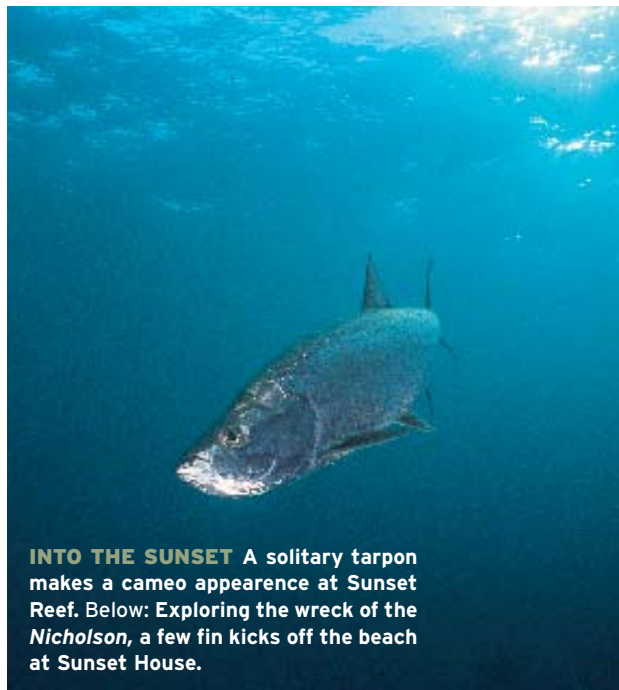
INTO THE SUNSET A solitary tarpon makes a cameo appearance at Sunset Reef. Below: Exploring the wreck of the Nicholson , a few fin kicks off the beach at Sunset House.

My fascination with the locals continued on my east-side dive at Kangaroo Gorge. There, a resident green sea turtle